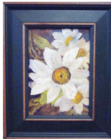
Oil Painting by Beverly Haas