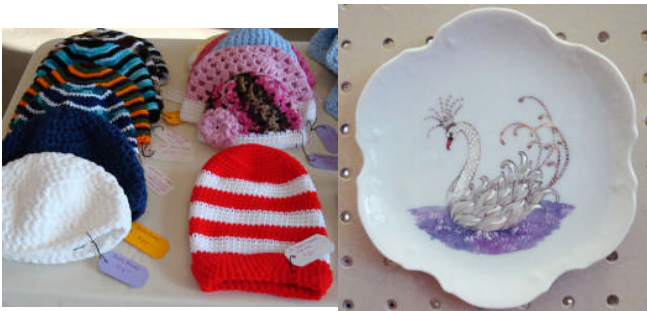
Crocheted Beanies by Lindsey Wolff